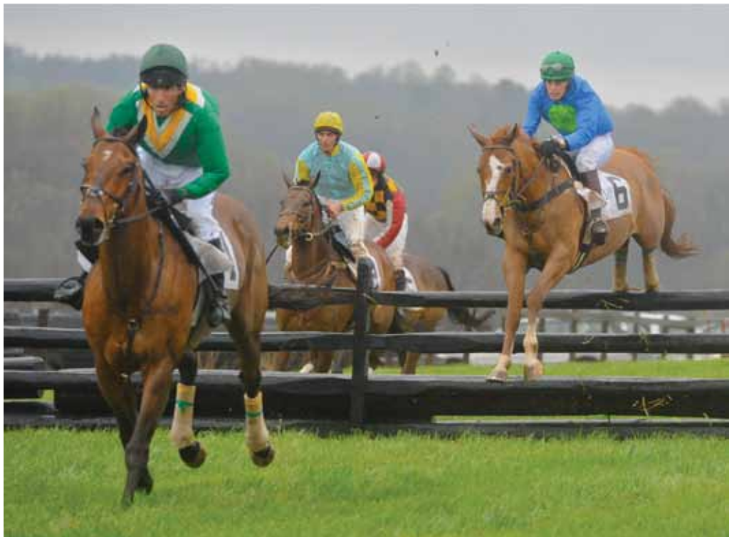
John Rush Streett Memorial (from left): Big Bad Joe leads the field over the tenth as Yin Yang (#6) sits just off the pace. Others are Native Mark, You and I (Ire) (third) and He's Got Mojo (second).