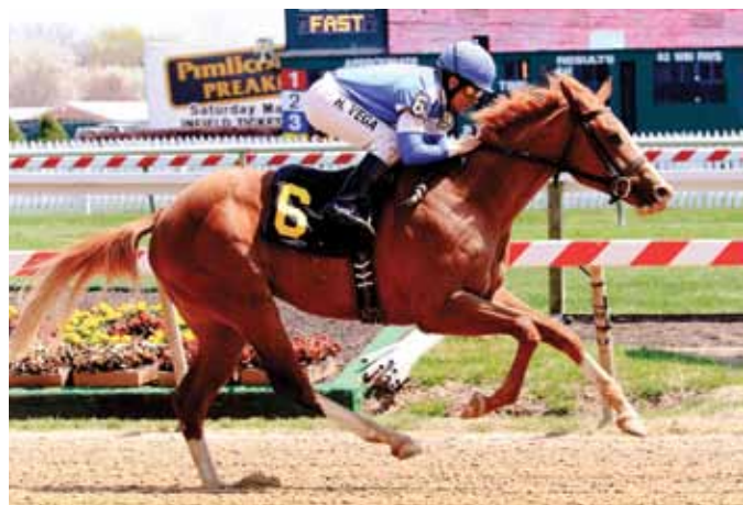
Bluegrass Atatude (Two Punch—Potomac Bend, by Polish Numbers) was all alone at the wire in Maryland's first race for 2-year-olds of 2011.

Bluegrass Atatude (out of Potomac Bend, by Polish