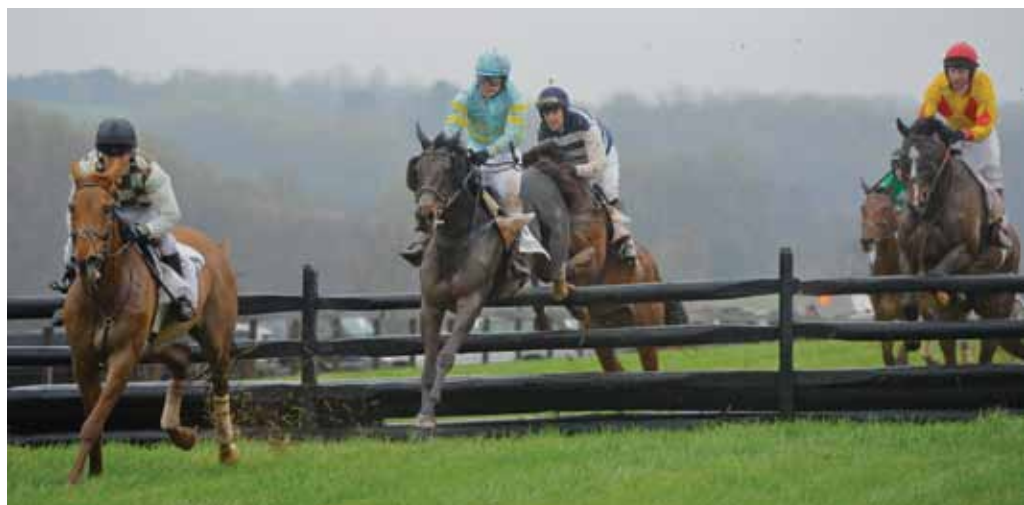
John D. Schapiro Memorial: Victorious Justpourit (Ire) races behind eventual second-place finisher Bar Nuit, followed by Thermostat (third) and Incaseyouraminer (fourth).

att, got on board this year and won the Piedmont race as a prep for the Manor.