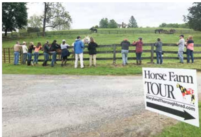
For the May 11th Horse Farm Tour, more than a dozen farms in Baltimore, Carroll, Cecil, Frederick and Harford counties welcomed hundreds of people who took advantage of the chance to visit Maryland's horse farms.