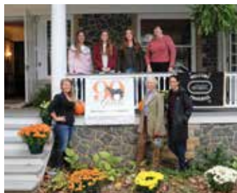
Country Life Farm hosted the closing event in October with members, friends and MHBA staff.

In 2019, the Maryland Horse Breeders Association celebrated its 90th anniversary with a variety of events, including banners bearing the 90th Anniversary logo gracing streets in Towson (our original home), Bel Air and Havre de Grace.