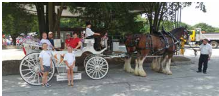
MHBA was proud to be "Grand Marshal" of the 4th of July parade in Towson, with the help of Suttler Post Clydesdales.