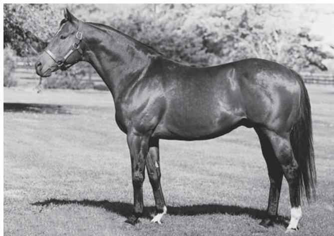
Not For Love is the nation's leading sire outside of Kentucky.

Broad Brush daughter Broad Expectations, joined the ranks of stakes winners at age 5 at Marquis Downs in Canada.