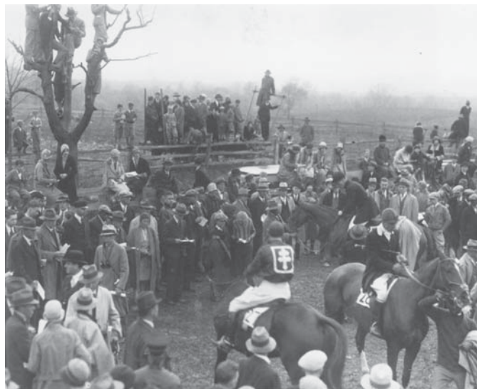
This photograph of the My Lady's Manor paddock in 1929 shows how people endeavored to get a good view of the activities. Note the men in the tree on the left, people crowded on the wagon, and a man perched on support scaffolding to the center rear of the photo.