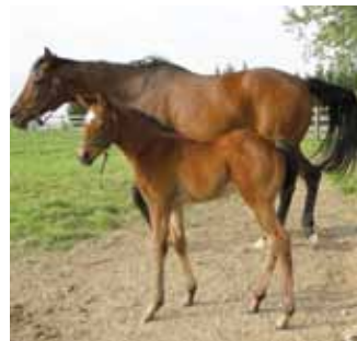
Black Fox Farm's filly by Lion Hearted, foaled on April 15, and her dam Lucky Bridle, by Unbridled Jet. Lucky Bridle is a half-sister to Maryland Million Turf winner Broadway Producer.