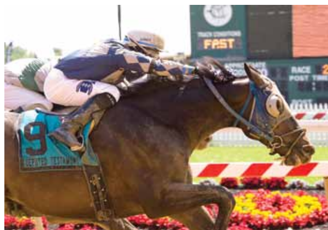
Silver Partner (top), makes the Kattegat's Pride Starter Handicap her third dirt victory of 2011. No Brakes launches an open-throttle rally to narrowly defeat Money for Love in the Deputed Testamony Starter.