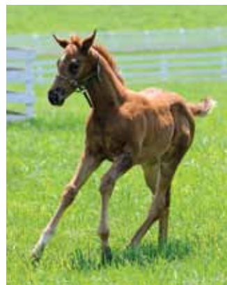
Greek Sun colt, bred by Marathon Farms Inc., is out of Two Punch's graded stakes-winning daughter Willa On the Move, the Maryland-bred champion 3-year-old filly of 2002.