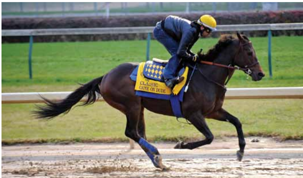
Game On Dude put his Maryland roots on display with a runner-up finish in the Breeders' Cup Classic-G1 for trainer Bob Baffert. The son of Worldly Pleasure is a leading candidate for an Eclipse Award.