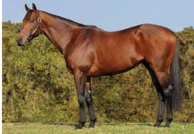
ELLEN B. PONS

Bonita Farm's Etched (top) and Merryland Farm's Friesan Fire are the two biggest names when it comes to new sires in Maryland for 2012.