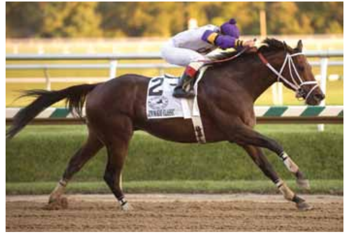
Stakes winners Admiral Alex (left) and Cuba (above) are other first-year sires joining the Maryland stallion ranks for 2012, at Shamrock Farms in Woodbine and Royal Wux Farm in Chestertown, respectively.

stallion roster, which also includes first-year sires Cuba (a son of Not For Love) at Royal Wux Farm in Chestertown and Admiral Alex (Afleet Alex) at Shamrock Farms in Woodbine.