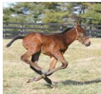
Filly by Sharp Humor out of Fifteen Moons (by Malibu Moon) flies at Country Life Farm.