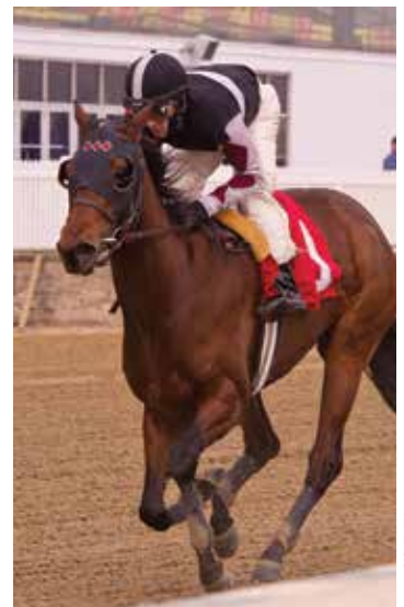
The 2012 Maryland Juvenile Championship Stakes winners Alpha Mike Foxtrot (left) and Walkwithapurpose are both out of Broad Brush mares.