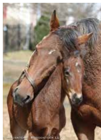
First-year mom Cursive has a special bond with her Divining Rod daughter.