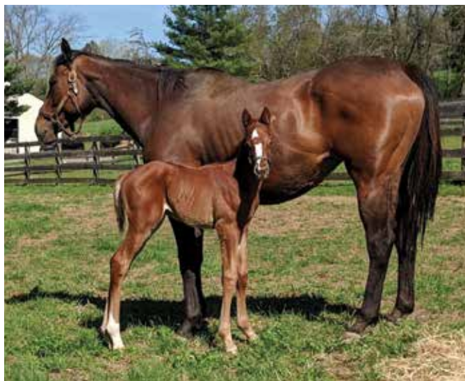
Bahala (by Not For Love) and her colt from the first crop of Northview Stallion Station sire Madefromlucky.