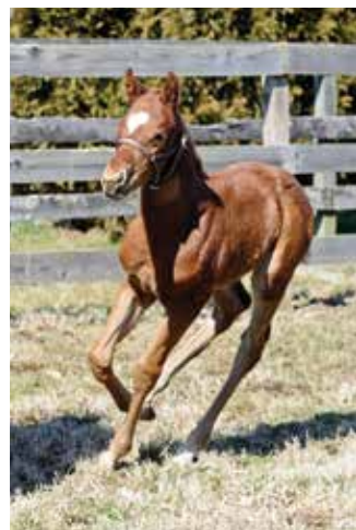
Orb colt bred by The Elkstone Group out of the Awesome Again mare Awesome Elle.