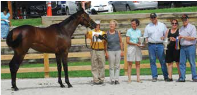
In 2015, Chanceland Farm retired their second Challenge trophy.