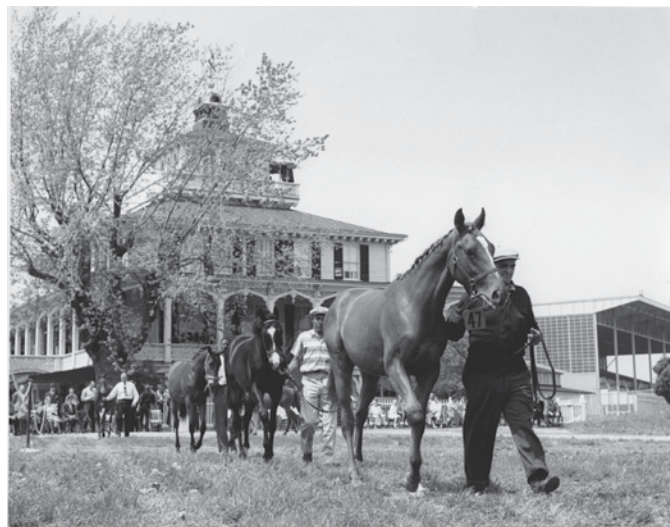
The show moved to the front lawn of Pimlico's picturesque old clubhouse in 1940 because a "coughing bug" was traveling through the track's stable area. Pimlico served as the host site from 1932 to 1959.

Participants, both human and equine, have been a who's who of the racing world, with a long list of esteemed horsemen having served as judge and numerous state-bred stars seizing the opportunity for their first public appearance.