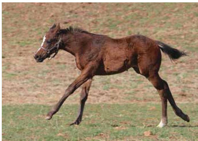
The first foal for Hillwood Stables' Jump Start mare Great Start, a filly by Golden Years, struts her stuff at Dark Hollow Farm.