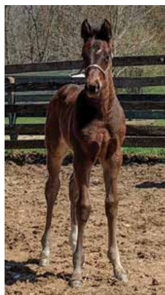
Filly by Great Notion out of Heavenly Moon is a half-sister to multiple stakes-placed $330,998-earner Moon Virginia.