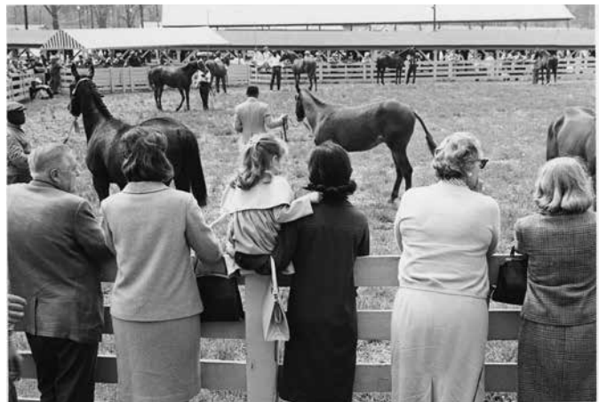
The event has occupied various sites at the Timonium Fairgrounds since moving to that location, and its old show ring, in 1960.

Maryland's first state-bred yearling show, held on a Thursday (May 12, 1932), was a superbly attended affair under less than ideal conditions. A crowd of approximately 500 people turned out at Pimlico two days before the Preakness, "braving cold weather, rain and mud," according to an account in The Blood-Horse .