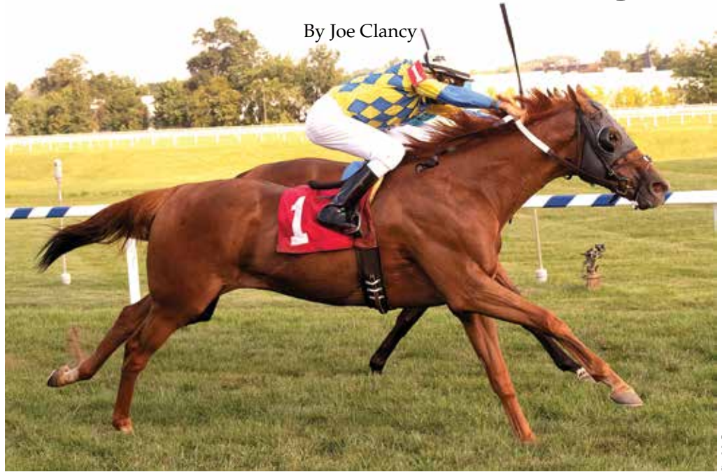
English Minister captured the Find Stakes on Maryland Pride Day by a neck.