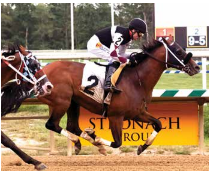
Where Paradise Lay became the second winner and first stakes winner for his dam, Sagamore champion Walkwithapurpose.

After his usual winter break, English Minister finished fourth at Laurel in April, then won twice on the synthetic track at Presque Isle Downs in May and June. One start before the Find, he defeated Grade 1 winner and millionaire Force the Pass in an allowance at Laurel Aug. 4.