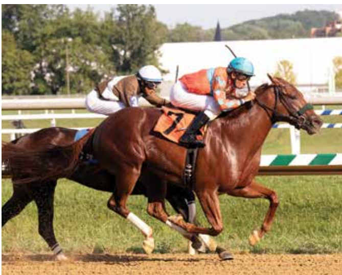
Successful turf runner Introduced notched her second dirt victory, and first stakes win, by taking the Miss Disco.