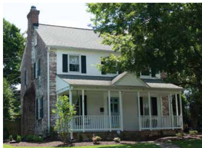
One Dixie Drive, the second official home of the MHBA, is less than 2 miles from the current offices in Towson.

Finney set up an actual location for the Maryland Horse Breeders office "in the front second-floor bedroom of our