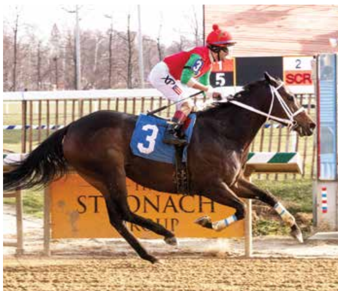
Great Notion's streaking daughter Anna's Bandit recorded her seventh stakes win of 2019, and ninth win of the year, in the Politely.