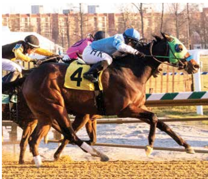
Third time was the charm for Lewisfield in the Bender Memorial after a second and third in two previous attempts.