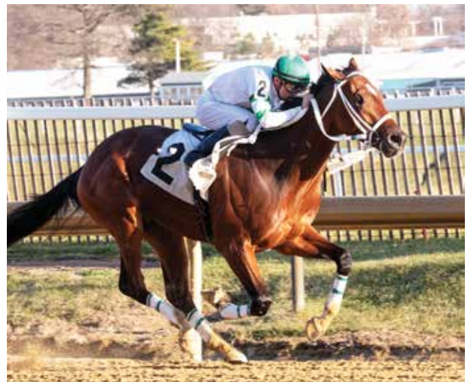
Golden Lad first-crop runners Hello Beautiful (top) and Laddie Liam dominated the juvenile stakes at Laurel in December.