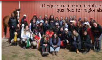
10 Equestrian team members qualified for regionals