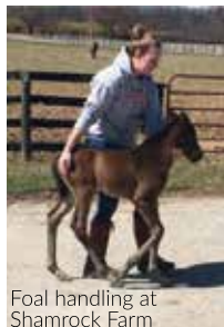
Foal handling at Shamrock Farm