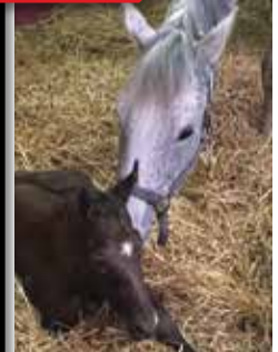
Students described assisting with foal births “life-changing”

“The way to get started is to quit talking and begin doing.” - Walt Disney