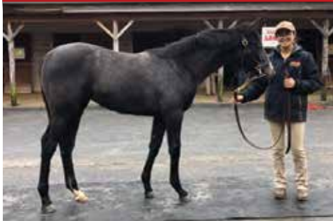
Fearless Ideas presented to buyers

Whether it be hands-on labs, field trips, student clubs, internships, or paid jobs, our UMD students have no shortage of equine experiences!