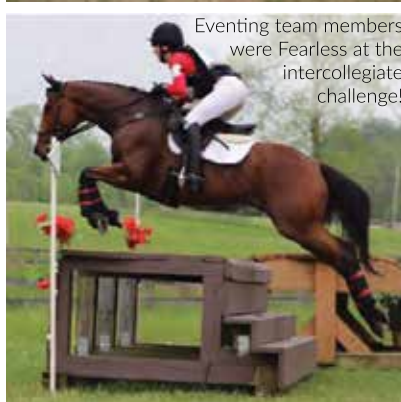
Eventing team members were Fearless at the intercollegiate challenge!

“The way to get started is to quit talking and begin doing.” - Walt Disney