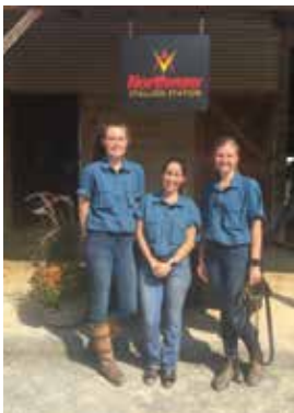
Working for consignors at professional sale