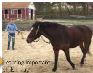
Learning important skills in lab