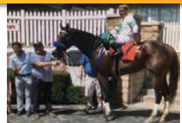
Congrats to UMD bred Fearless Terp for earning over $100k in his racing career!