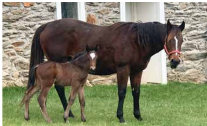
Onearmedbandit, the stakes-winning dam of 10-time stakes winner Anna's Bandit, with her Mosler colt born in January.