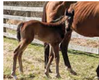
Great Notion filly is out of multiple stakes-placed My Little Josie (by Outflanker).