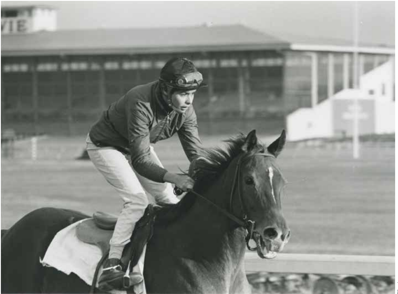
The first woman to be licensed as a jockey in the United States, Kathy Kusner gallops a Thoroughbred at Bowie.