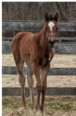
Bourbon Courage filly out of Level With Me is a half-sister to Hashtag Selfie.

SAFE WITH ME, by Discreetly Mine, b.c., Feb. 1, by Great Notion. Jagger Inc. Mare to Uptowncharlybrown.