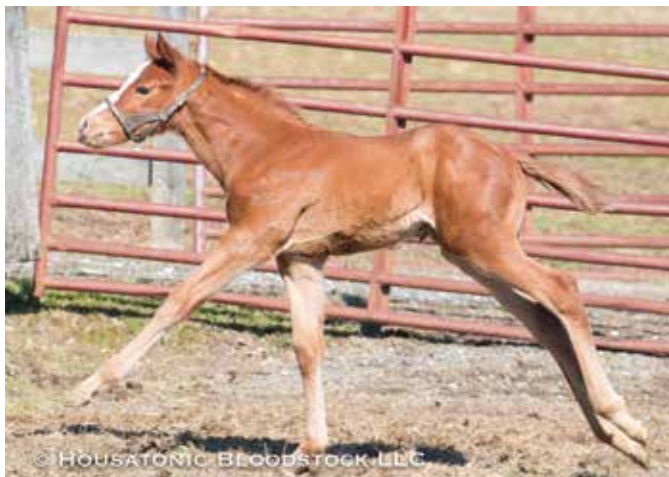
Hurryupandcomeback with her first foal, a colt from the first crop of Army Mule born in February at Murmur Farm.