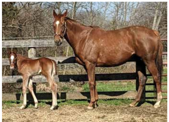
Filly by Redeemed bred by Leaf Stable and foaled at Willowdale is the first foal for the winning Bellamy Road mare Enterprise Value.