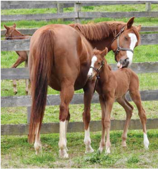
Fingerpaint displays her affection for her first foal, a daughter of Hoppertunity bred by Designated Hitters Racing and born April 10.