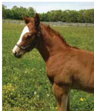
Munnings colt is out of Mo Light, a granddaughter of four-time Grade 1 winner Lite Light.