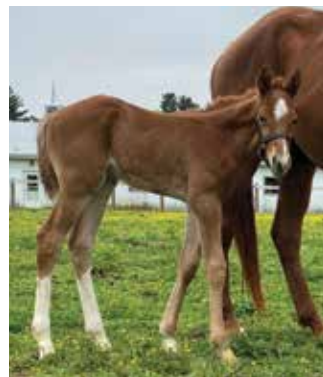
Irish War Cry—Secure Access colt descends from Kentucky Oaks-G1 winner Secret Status.