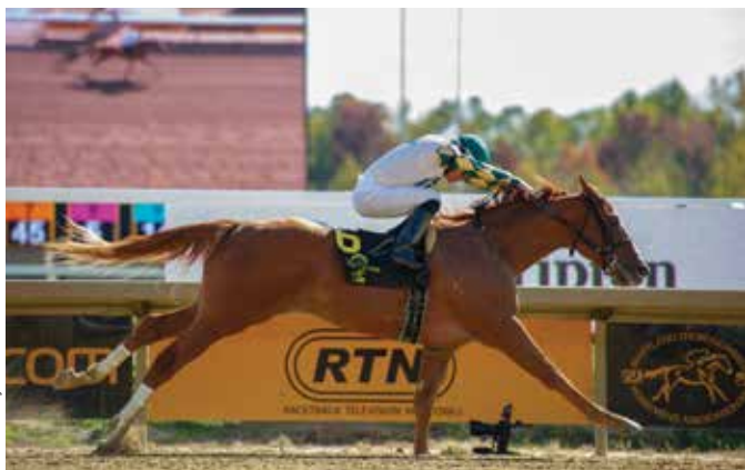
Ournationonparade won the Maryland Million Nursery last fall.