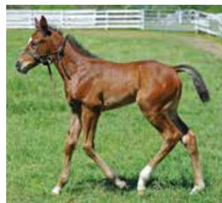
Tale of the Cat filly out of Perfect Gleam is from the family of Menifee and Desert Wine.