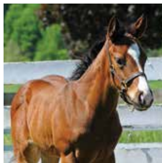
Golden Lad colt is out of Noble Nation, a half-sister to graded stakes winner Noble Indy.