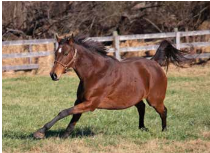
Congaree Princess flashes her stride in the paddock.