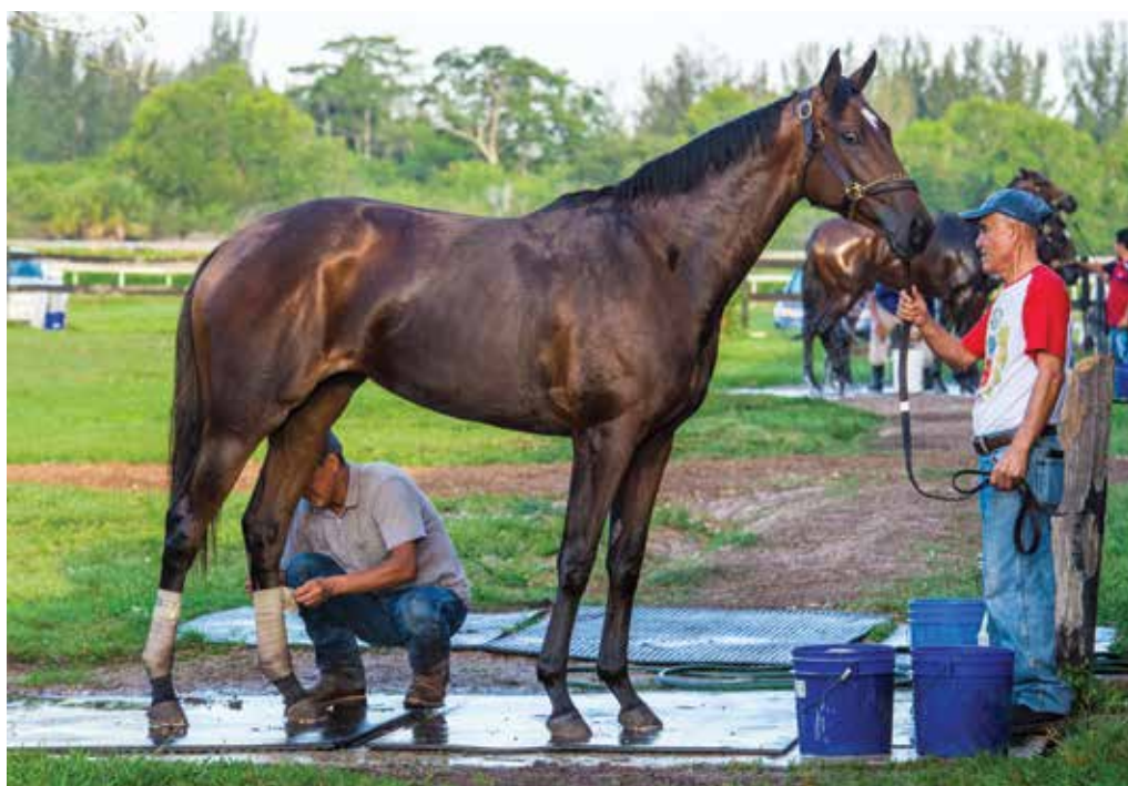
Last year's Yearling Show Champion Where's Bridgit was in Florida before shipping out to Saratoga.

Looking back on MHBA yearling show stars